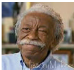
Gordon Parks 1912- Biography

A versatile and prolific artist, Gordon Parks, Sr. warrants his status as a cultural icon. The poet, novelist, film director, and preeminent documentary and fashion photographer was born on November 30, 1912 , in Fort Scott, Kansas , the youngest of fifteen children. Parks saw no reason to stay in Kansas after the death of his mother and moved to St. Paul, Minnesota , at age sixteen to live with his sister. After a disagreement with his brother-in-law, Parks soon found himself homeless, supporting himself by playing piano and basketball and by working long hours as a busboy.