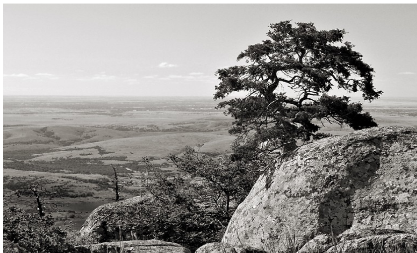
ROCKS & CEDAR