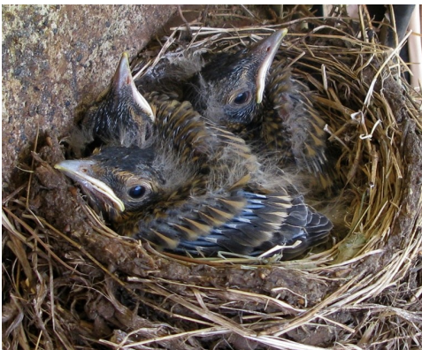
1st Place-Alta Srotyr-Baby Robins

Note: All of the following contestants are shown on the Metro Camera Website listed under Digital Treasure Hunt. www.metrocameraclub.org