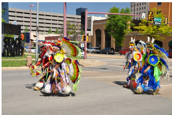
"Red Earth Festival Dancers"